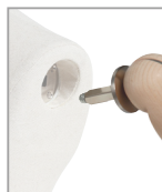
push and pull